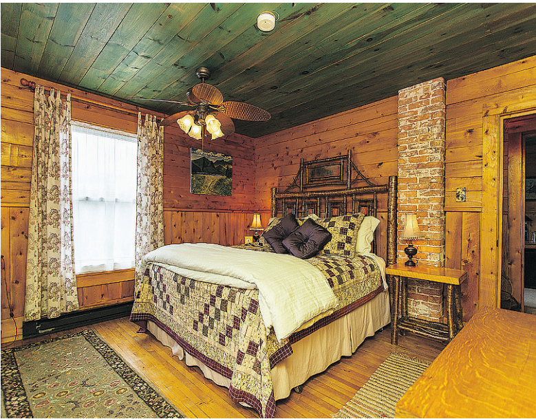
The cosy Paradox Lodge in Lake Placid, which will host a women’s wellness weekend from March 18 to 20, has hand-carved furniture and a waterfront setting.

the brides wear white fur capes for warmth, and the guests are seated on pews of ice.