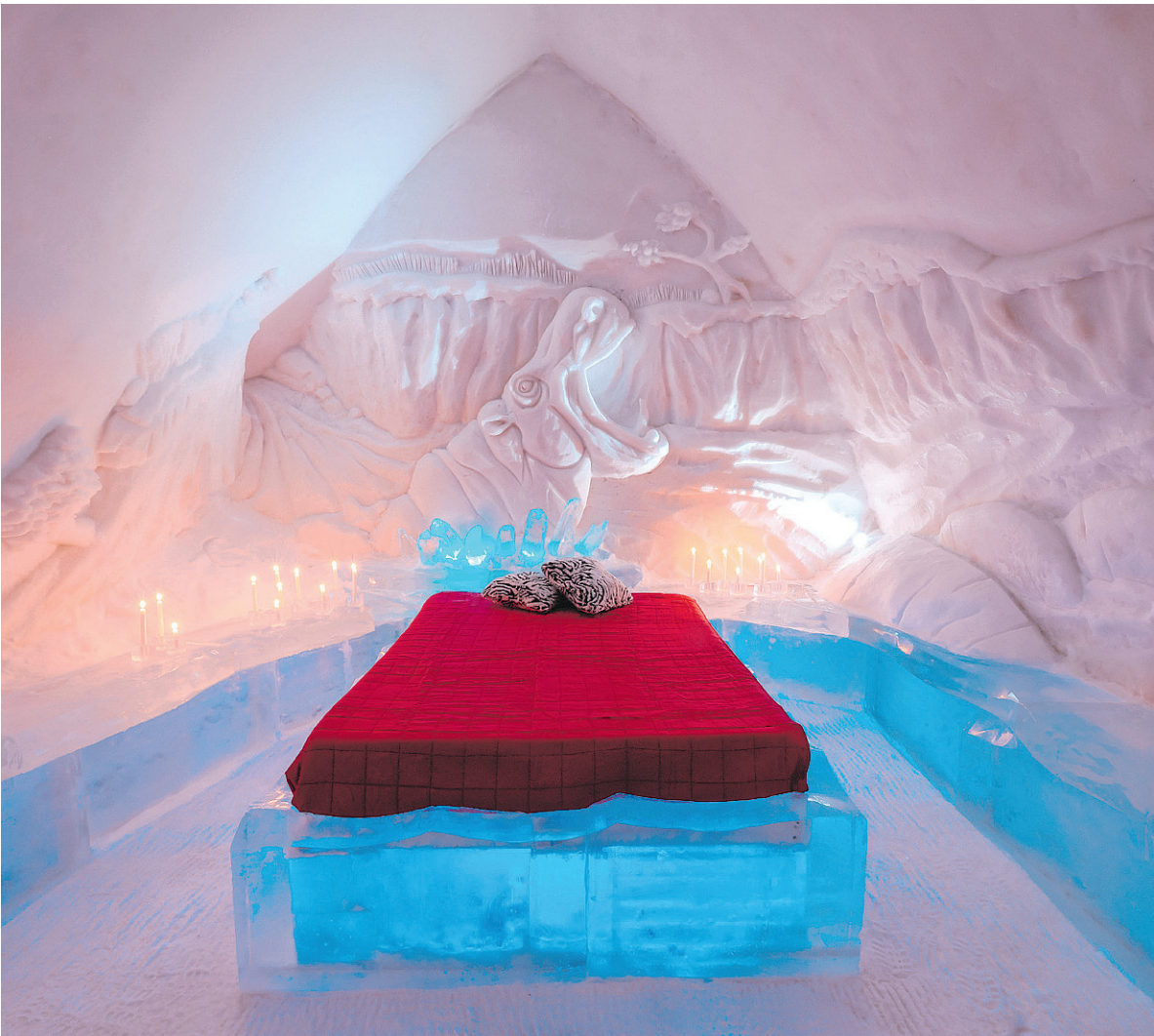
The décor theme for 2016 at Hôtel de Glace, near Quebec City, is Rivers. The room shown is inspired by Africa and features an ice sculpture of a hippopotamus and other intricate wall carvings.

Hôtel de Glace is so romantic and enchanting that it is hosting around 24 weddings this winter in a new chapel. Many of